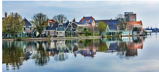
River Zaan Zaans Schans Old Village Countryside

If you wish to come for only a part of the retreat, please indicate as to when you will be coming on the registration form. Prices are pro-rated on form.