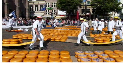
Alkmaar Cheese Market, Holland

*Your favorite snack to share: fruit, veggies, chips, desert, etc.